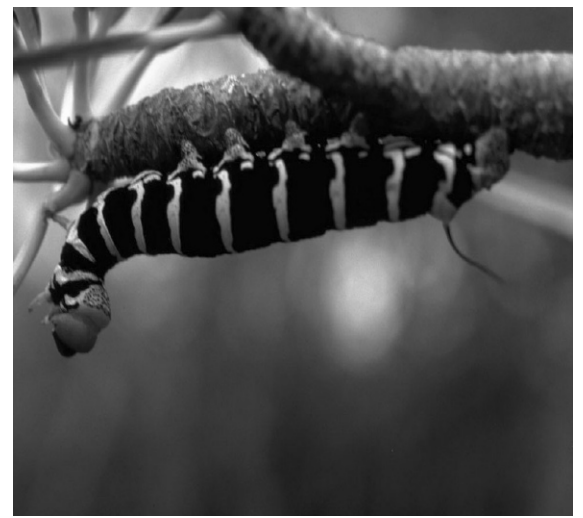
the individual. Earlier theories How does a caterpillar 'use' its protective had used 'God' or 'Nature' to coloration?

mystical so Lamarck suggested that use or disuse of various organs was an important factor for selecting what should be passed to the next generation. Clearly this is unsatisfactory (as was pointed out at the time). A caterpillar may 'use' legs to crawl away, but in what sense does it 'use' its protective colour or unpleasant taste? In what way would a brilliantly coloured insect with pleasant flavour 'disuse' these characteristics? For a